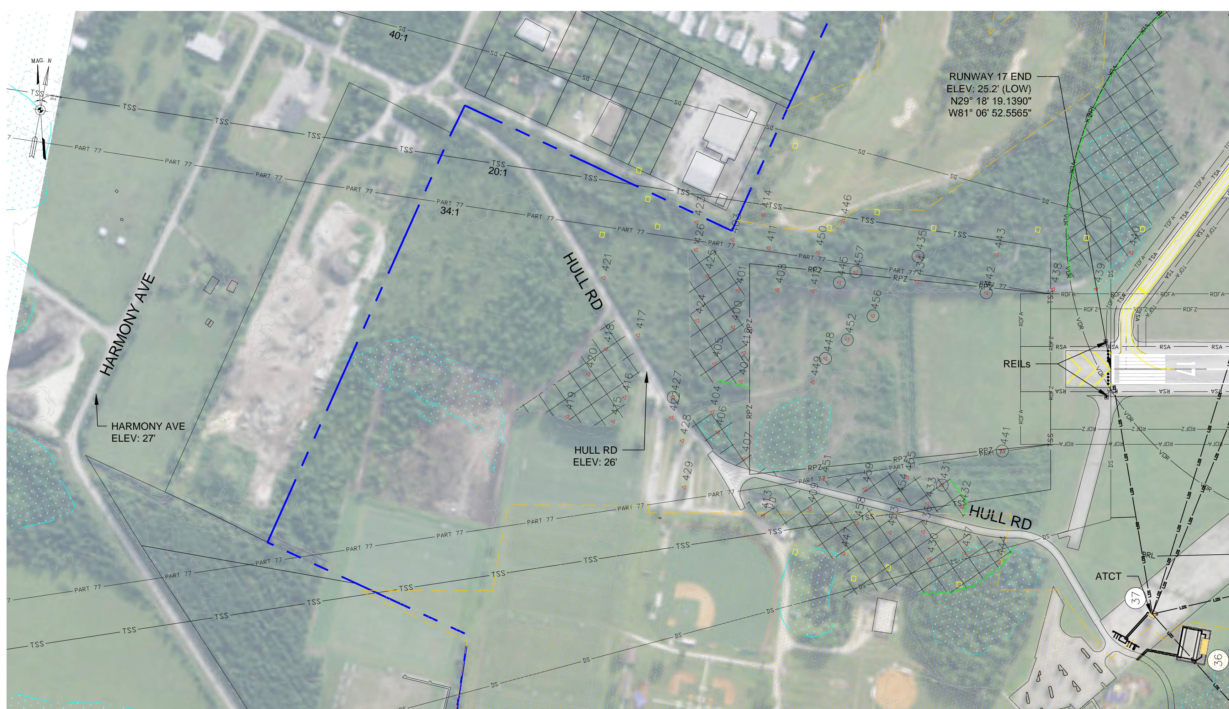
RUNWAY 17 END PROFILE