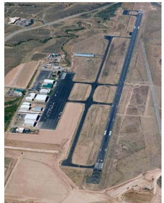
Garfield County Airport-Rifle, CO