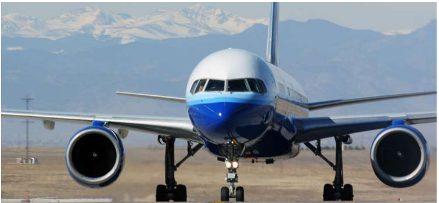
Denver International Airport -Denver, CO