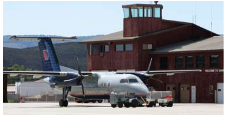
Gunnison-Crested Butte Regional Airport-Gunnison, CO

Data Provided by the Federal Aviation Administration.