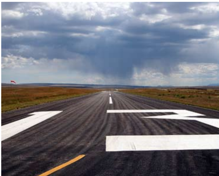
Silver West Airport