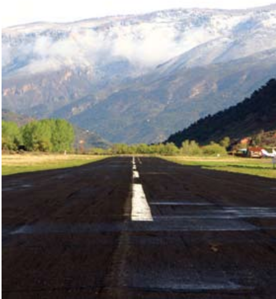
Glenwood Springs Airport

The Colorado Division of Aeronautics conducts an inspection and analysis of airport pavements. The analysis is required by the Federal Aviation Administration (FAA) in order for airports to be eligible for Federal funds. The FAA requires a PCI inspection completed once every three years. The Division inspects approximately one third of the airports every year to complete a cycle every three years. The engineering program used to determine the PCI is called Micro Paver. The airport PCI results are an important planning tool for each airport's pavement maintenance program, and their Capital Improvement Program. This information is used by the Division of Aeronautics and the FAA Airports District Office to determine priority distribution of State and Federal pavement maintenance funds. The Division's goal is to maintain Colorado's primary airport pavements at an average PCI score of 75 or above.