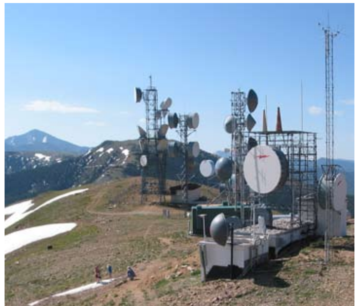
Monarch Pass AWOS

The objective was to make the collection and transfer of certified weather data affordable enough to allow an affordable means to connect Colorado State and Local Government owned weather systems to the FAA. This in turn would benefit numerous state and local governments nationwide by allowing their participation in this system. The end result of this will be the inclusion of most or all of the 500 plus systems that are now stand alone. This additional data will make flying safer, increase the accuracy of forecasting and provide better information for pilots and other aviation professionals.