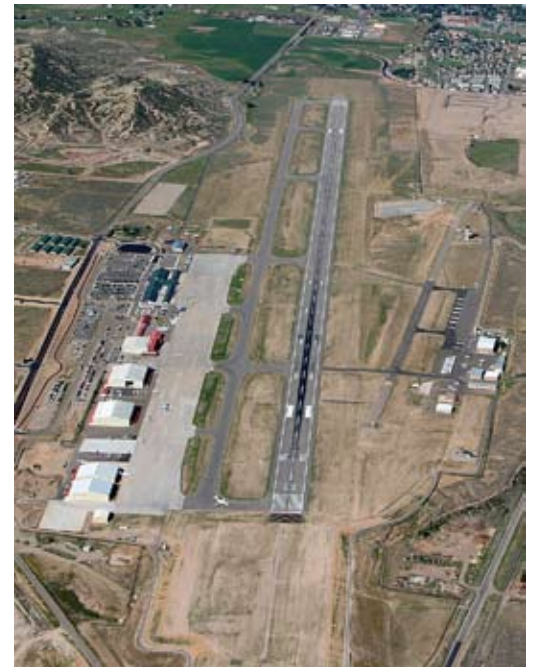
Eagle County Regional Airport-Eagle, CO