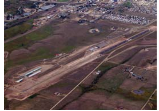
Grand County Airport-Granby, CO

In addition to the normal Airport Improvement Program (AIP) grants, Colorado Airports received an additional $39 million in grants courtesy of the American Recovery and Reinvestment Act (ARRA) program. Seven airports were recipients of these funds, which included, Aspen/Pitkin County, Centennial, Colorado Springs Municipal, Denver International, Durango/La Plata County, Grand Junction Regional and Fort Collins-Loveland Municipal. Projects included a runway rehabilitation at Denver, taxiway rehabilitations at Centennial, Colorado Springs and Fort Collins-Loveland and apron rehabilitations at Aspen, Durango and Grand Junction.