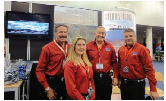
Representatives of the Garfield County Airport at NBAA.

Loans awarded to airports from the SIB have been used for projects such as capital airport improvements; air traffic control towers, snow removal equipment, and pavement reconstruction. Loans have also been utilized for land acquisitions protecting airports from residential encroachment.