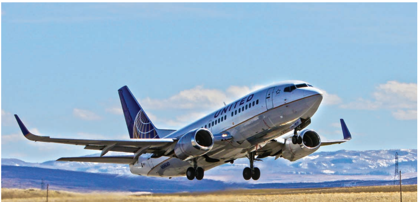
Yampa Valley Regional Airport - Hayden, Colorado.