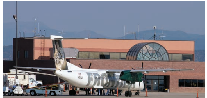
Durango - La Plata County Airport.

Data Provided by the Federal Aviation Administration.