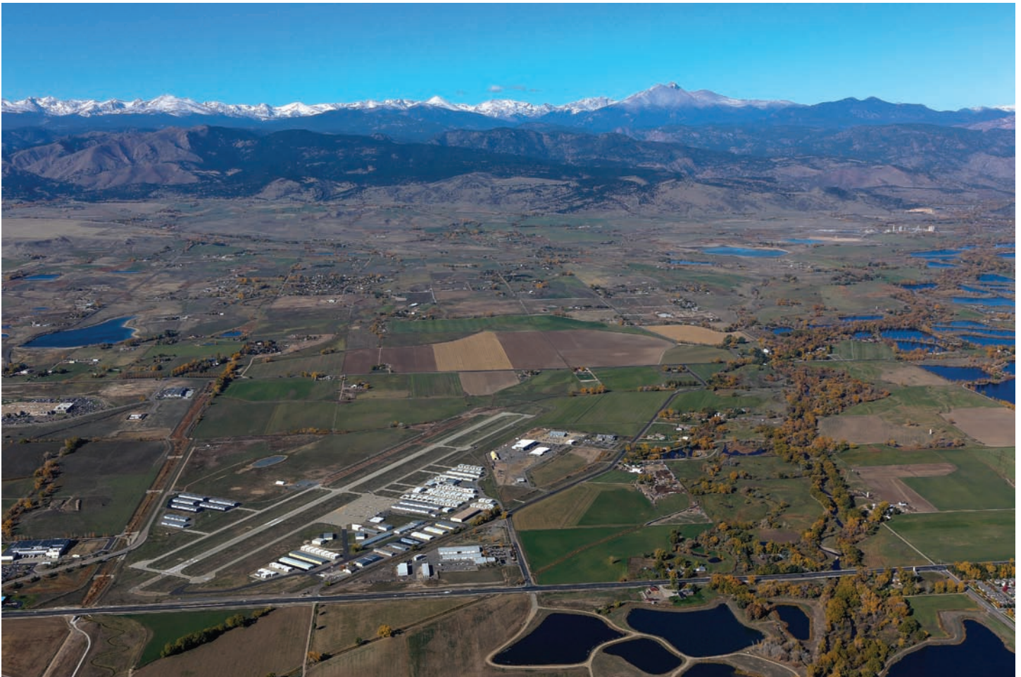
Vance Brand Municipal Airport - Longmont, Colorado.

The Division was involved in many significant projects in 2013. A few of those projects include a runway reconstruction and ramp expansion at Meeker Airport, a new taxiway at Centennial Airport, rehabilitation of a portion of Pena Boulevard at Denver International Airport, and runway safety area enhancements at Rocky Mountain Metropolitan Airport. These four projects alone accounted for nearly $10 million from the Colorado Discretionary Aviation Grant Program.