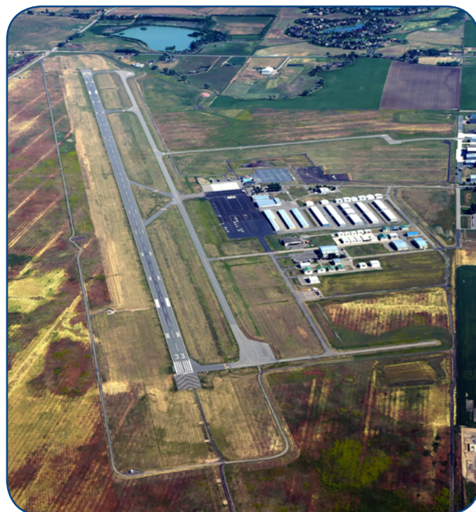
The Fort Collins-Loveland Municipal Airport (FNL) will be the initial test facility for VACT technology.

This CDOT Aeronautics Division-led initiative to test VATCT technology in Colorado will further solidify CDOT and the Colorado Division of Aeronautics as a national leader in airspace technology innovation, enhancing aviation safety, capacity and efficiency, while minimizing the overall capital and operating costs. The $10 Million in funding for the test phase of this monumental project is being provided by the Colorado Aviation Fund and unanimously approved by the Colorado Aeronautical Board (CAB).