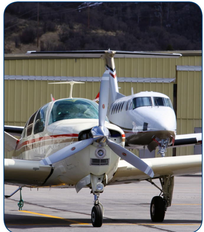
Steamboat Springs Municipal Airport.

The Aviation Fund Balance remaining as of June 30, 2015 was $303,344.