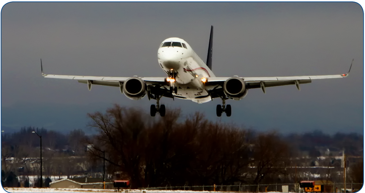
A commercial air charter flight arrives at the Fort Collins-Loveland Municipal Airport.

Data Provided by the Federal Aviation Administration.