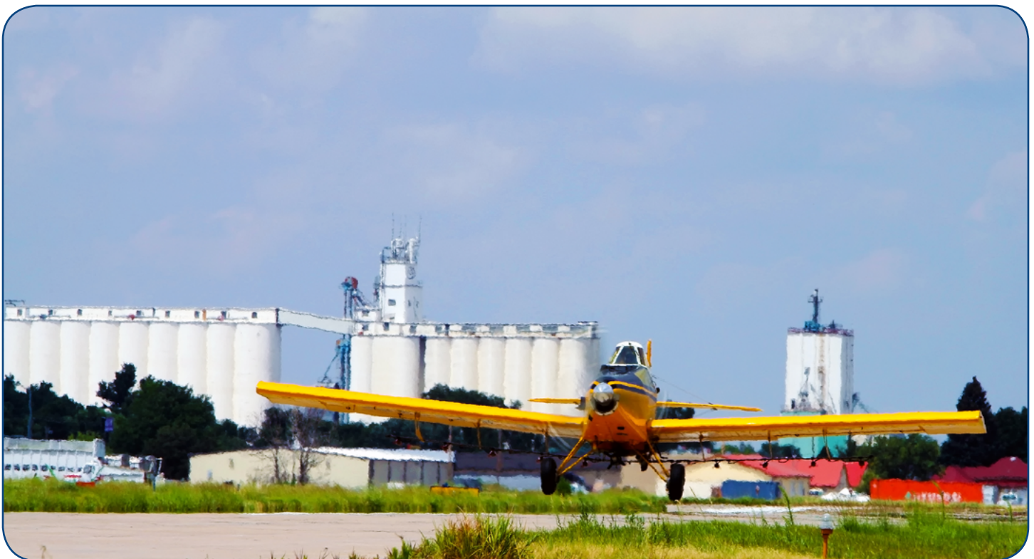
An Agricultural spraying aircraft departs the Yuma Municipal Airport (2V6). The Yuma Municipal Airport was awarded a $268,000 aviation grant in FY2015 to reconstruct the main runway.