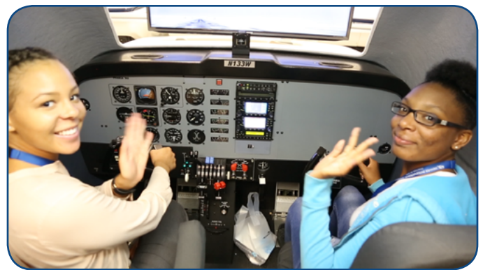
Two young ladies test their piloting skills in a flight simulator at Metropolitan State University of Denver's World Indoor Airport during the 2015 Girls in Aviation Day event. YouTube Video Link.

Additionally, the Division takes a proactive and consistent approach in distributing pertinent aviation information to its public and private stakeholders through a coordinated use of social media including Facebook, YouTube, the Division of Aeronautics web page, mass e-mail communication, the Mountain Wave News Bulletin, and live streaming of Colorado Aeronautical Board meetings.